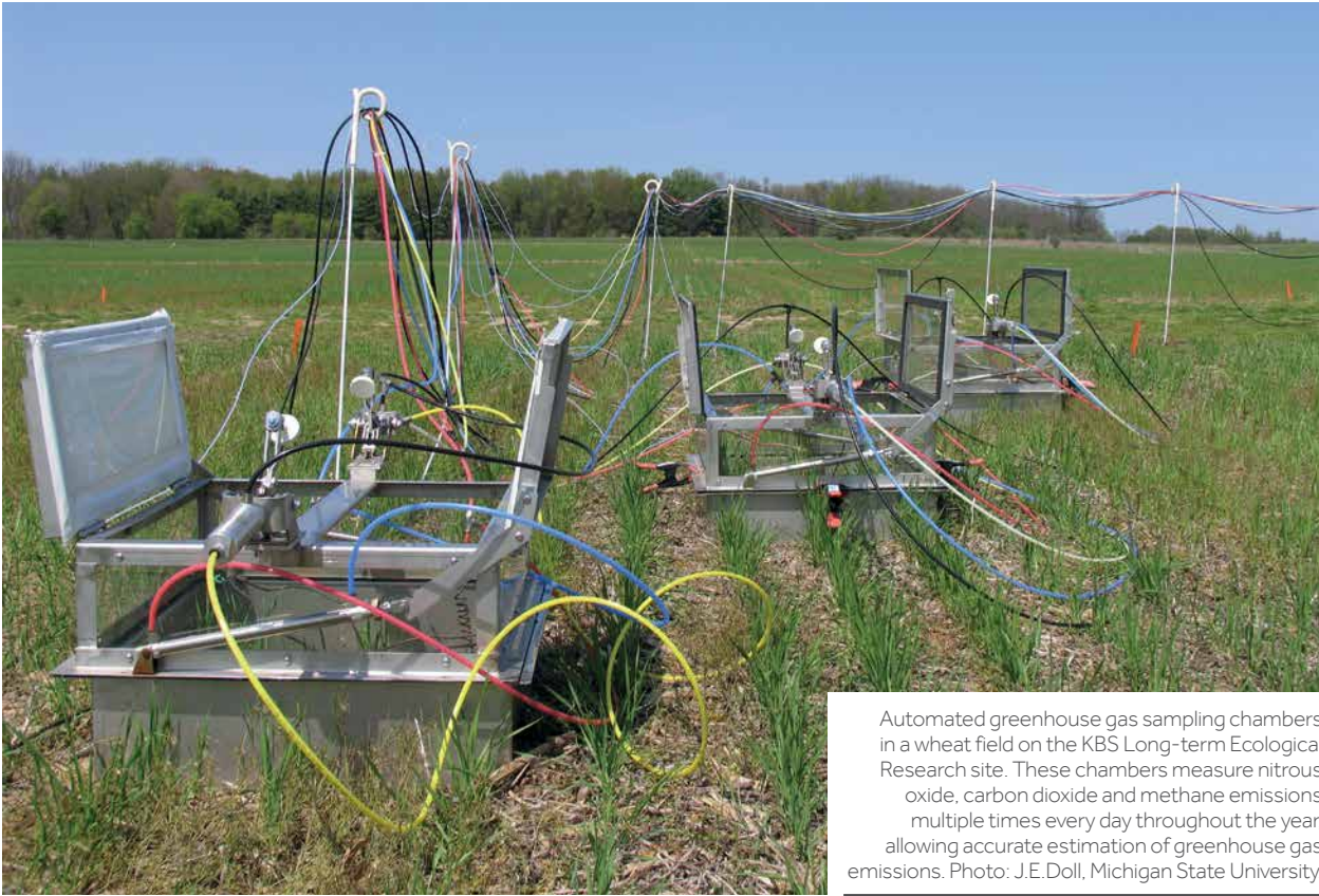
Automated greenhouse gas sampling chambers in a wheat field on the KBS Long-term Ecological Research site. These chambers measure nitrous oxide, carbon dioxide and methane emissions multiple times every day throughout the year, allowing accurate estimation of greenhouse gas emissions.