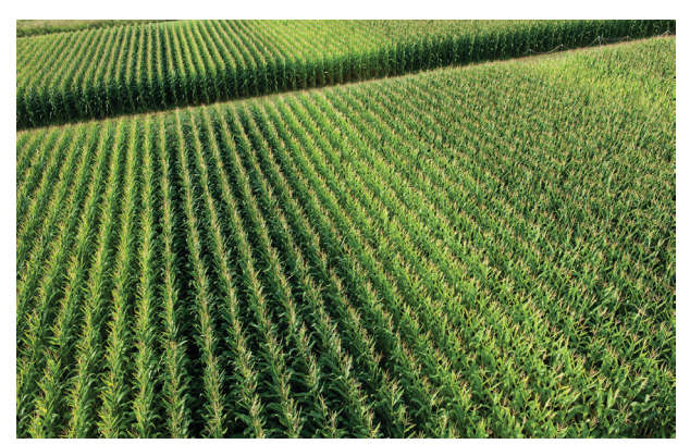
Aerial view of the KBS Long-term Ecological Research experiment showing corn's response to varying levels of nitrogen fertilizer rates. Data from this and other experiments across Michigan showed how nitrogen rates can be reduced, resulting in lower nitrous oxide emissions without harming crop yield.

Precision fertilizer application can also improve NUE by tailoring N application to soil spatial variability. Adding less N to those parts of a field with low yield potential, as measured by yield monitoring, will avoid wasting N on locations in the field that are