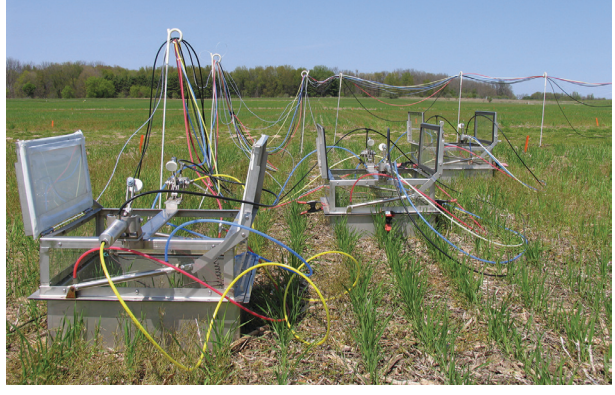
Automated greenhouse gas sampling chambers in a wheat field on the KBS Long-term Ecological Research site. These chambers measure nitrous oxide, carbon dioxide and methane emissions multiple times every day throughout the year, allowing researchers to accurately estimate greenhouse gas emissions.

Nitrous oxide is produced by microbes in almost all soils. In agriculture, N<sub>2</sub>O is emitted mainly from fertilized soils and animal wastes—wherever nitrogen (N) is readily available. In the United States, agriculture accounts for approximately 8 percent of all greenhouse gas emissions but contributes about 75 percent of all N<sub>2</sub>O emissions linked to human activity<sup>2</sup>. Of